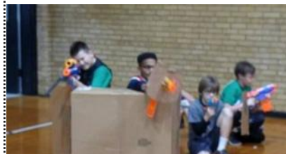
Out large gym is perfect for a nerf birthday!